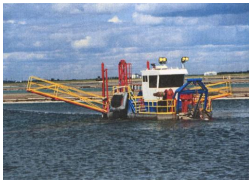
Dredge on cooling pond